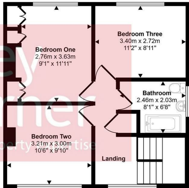
First Floor Approx 47 sq m / 501 sq ft

This floorplan is only for illustrative purposes and is not to scale. Measurements of rooms, doors, windows, and any items are approximate and no responsibility is taken for any error, omission or mis-statement. Icons of items such as bathroom suites are representations only and may not look like the real items. Made with Made Snappy 360.